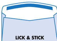
LICK & STICK